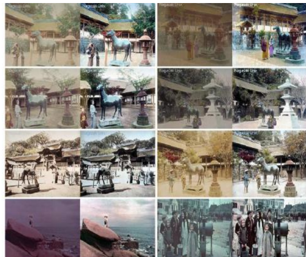
Fig.2. To each sub-figure, the left one shows original image which has obvious tonal distortion. The right one is the result gotten by the proposed method

Tone mapping for HDR Image is another natural application for the proposed model. Many tone mapping algorithms have been proposed through the years, e.g. those. Although the methods, based on local adaptive filtering achieve encouraging results, the global method, such as gamma correction, is still the most popular choice because of its robustness and lower complexity. We test our method on the HDR images captured by Nikon D7005 and map them into 8-bit and compare the results with those from the default tone mapping process in MATLAB and gamma correction. Although the default tone mapping in MATLAB can reveal some image details, it cannot recover the color of image correctly. In other words, the contrast is enhanced but the tone bias is raised.